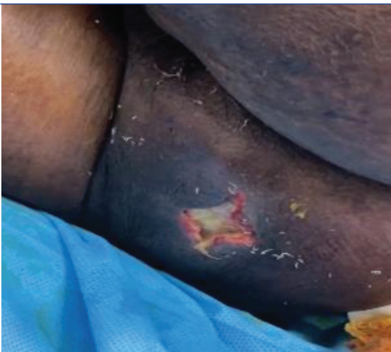
[Table/Fig-1]: Showing Enterobius vermicularis worms crawling in and around the bed sore (case 1).

A 40-year-old male, known to be a type 2 diabetic for four years and currently on regular oral hypoglycaemic drugs, presented with pus discharge from the perianal region for a duration of two years and had recently started experiencing pain for the past two weeks. On local examination, a Fistula-in-ano was noted, with an external opening at the 5 o'clock position and an internal opening